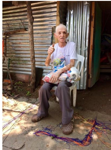
Recipients of the Solidarity Food Baskets

We welcome your support. Donations are tax-deductible. Checks payable to: ADEES 705 Winhall Way Silver Spring, MD 20904 ADEES is a 501(c)(3) tax-exempt non-profit organization in the State of Maryland.